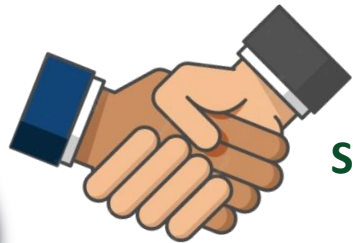
STRATEGIC KNOWLEDGE PARTNER